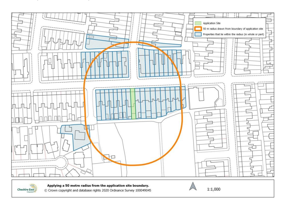
Figure 5.1: Applying a 50 metre radius

5.5 The assessment of the number of existing HMOs within a 50 metre radius includes both small and large HMOs and not just those HMOs that require planning permission. The council will gather this information from planning permission data, licencing information and other data sources when assessing planning applications for new HMOs.