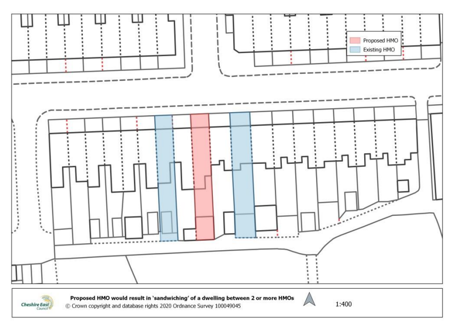
Figure 5.2 Sandwiching